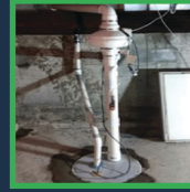
Radon Mitigation Systems