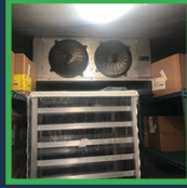
Walk-in Food Coolers