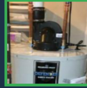
Gas Evacuation Systems