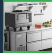
Under Counter Refrigeration