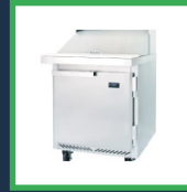
Refrigerated Prep Tables