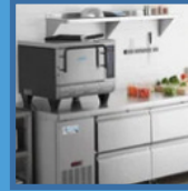
Under Counter Refrigeration