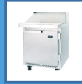
Refrigerated Prep Tables